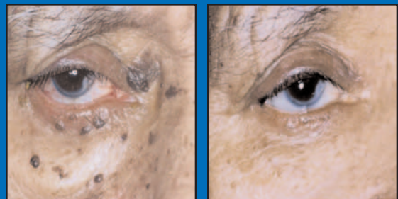
Cutaneous Lesion Removal