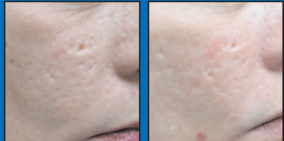
Acne Scar Reduction