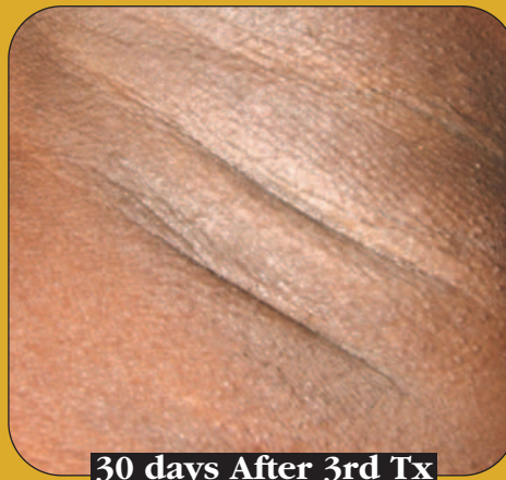
30 days After 3rd Tx

Laser Hair Removal, Axilla, Skin Type VI