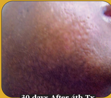
30 days After 4th Tx

PFB (Pseudofolliculitis Barbae) Treatment, Skin Type VI